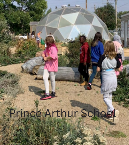
Prince Arthur School