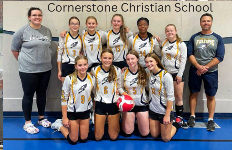
Cornerstone Christian School

If you have any stories or ideas to share in the newsletter, please email us at communications@prairiesouth.ca .