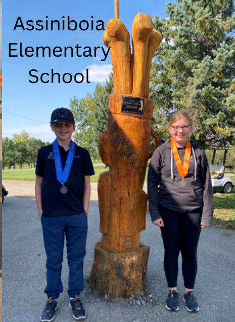
Assiniboia Elementary School