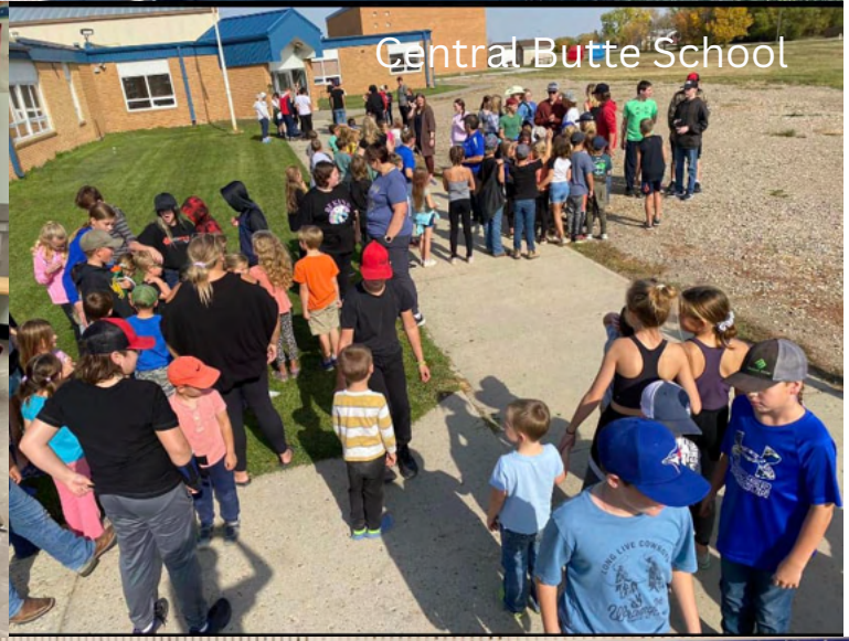
Central Butte School