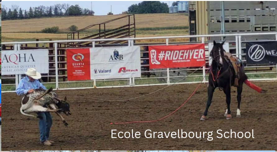
Ecole Gravelbourg School