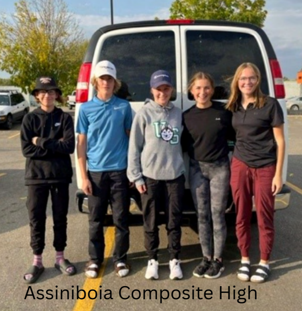
Assiniboia Composite High