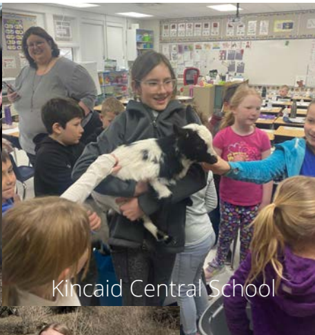
Kincaid Central School