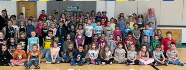
Assiniboia 7th Avenue School