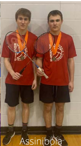
Assiniboia Comp High