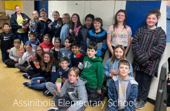
Assiniboia Elementary School