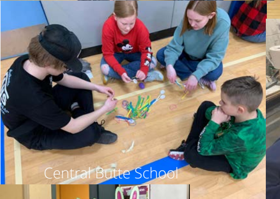
Central Butte School