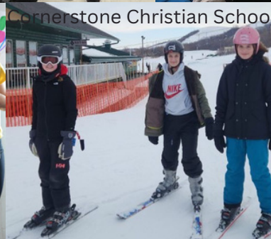
Cornerstone Christian School