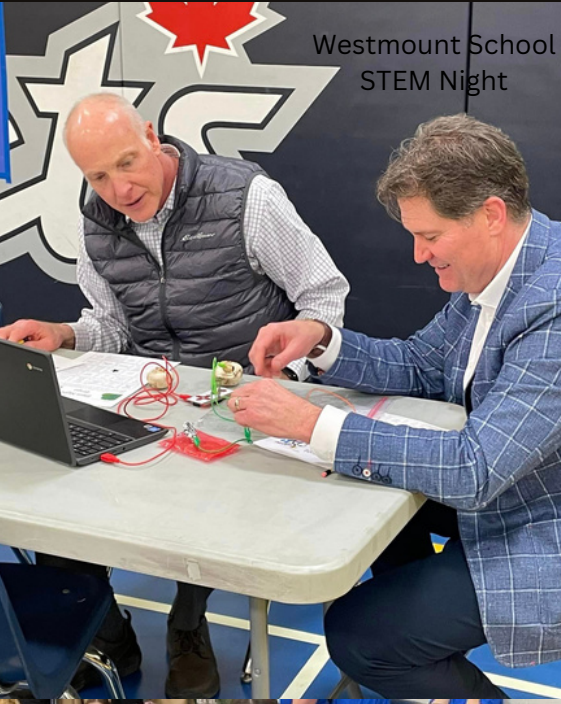
Westmount School STEM Night