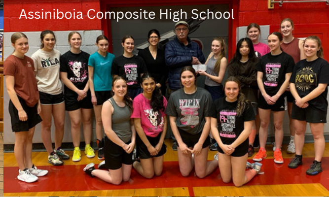
Assiniboia Composite High School