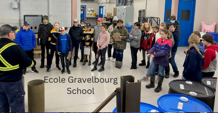
Ecole Gravelbourg School