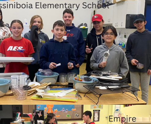
Assiniboia Elementary School