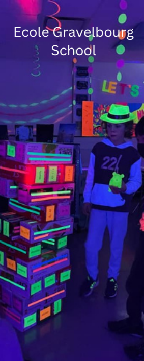
Ecole Gravelbourg School