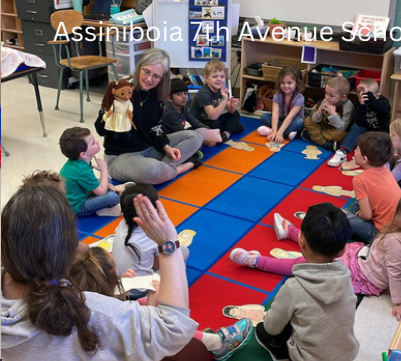
Assiniboia 7th Avenue School