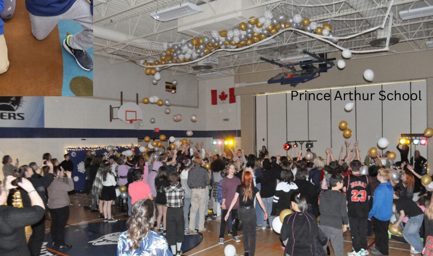
Prince Arthur School