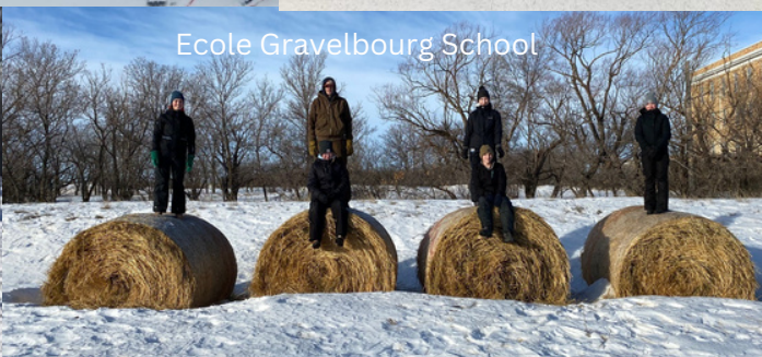
Ecole Gravelbourg School