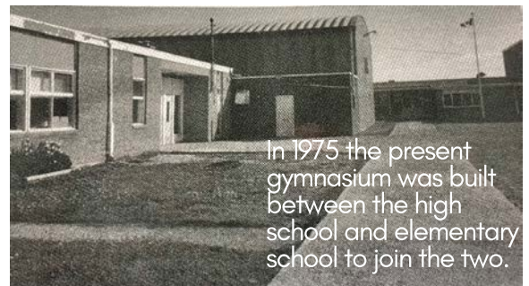
In 1975 the present gymnasium was built between the high school and elementary school to join the two.