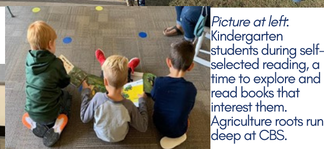
Picture at left: Kindergarten students during self-selected reading, a time to explore and read books that interest them. Agriculture roots run deep at CBS.