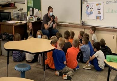
Picture above: Grade 1&2 Students learning about reconciliation and how we can all be better at understanding others' points of view.