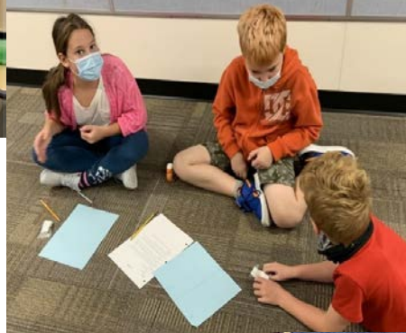
Picture below: Grade 5&6 students acting as math mentors for Grade 3/4 students. Never too young or too old to be the teacher or the learner.