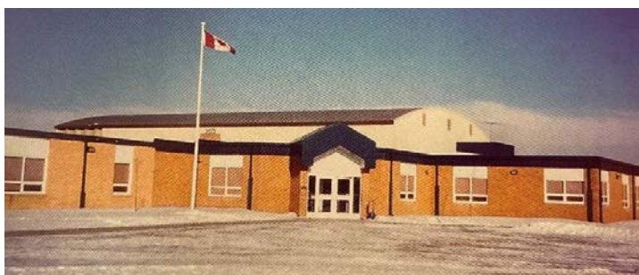
In 1999 extensive renovations were completed to the school.