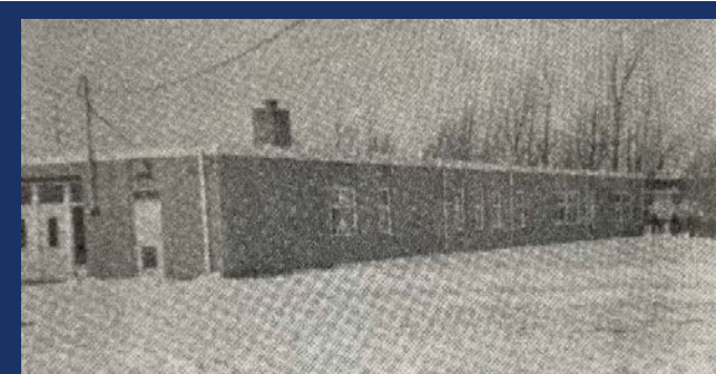
In 1966 the present elementary school opened with 9 rooms to accommodate the students from the old brick school and satellites.