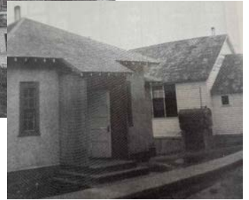
In 1919 the brick 4-room school was opened. As the school population increased over the years the former Union Jack and Menzie schools were moved into town and used as satellite schools.