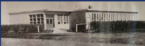
As the student population continued to rise, 1969 saw the 4-room school from nearby Lawson moved in and attached to the north end of the school.