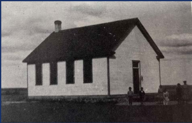
Late in the fall of 1908 the first Central Butte School opened. It was originally placed on a farm outside of the townsite but was later moved.

Information summarized from: Our Heritage - A view from the Butte 1988 and Retrospect - Central Butte School yearbooks