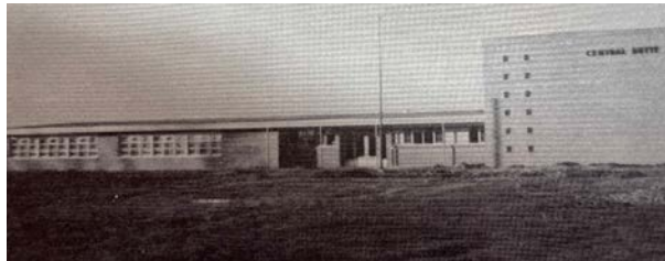
1959 saw the opening of the present high school with 3 classrooms, gymnasium/auditorium, home economics room, workshop, chemistry lab and library. In 1963 four additional classrooms were built on to the north end of the existing high school.