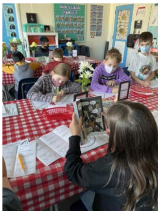
Grade 6 ELA Class having a Book Tasting.

A proud tradition carried on at ÉGS is the Annual Oratory Competition; held in both French and English. Every January students grades K-8 study to memorize and present poems. Students compete within their classrooms for the honour of competing at the school competition. Each year the top two entries from each grade are sponsored to enter the Gravelbourg Music Festival, where they represent themselves and our school.