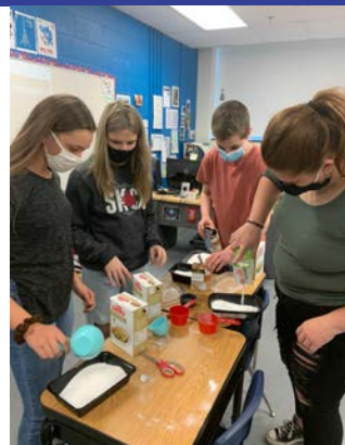
Grade 9 Students Mummifying Hot Dogs in Sciences humaines 9