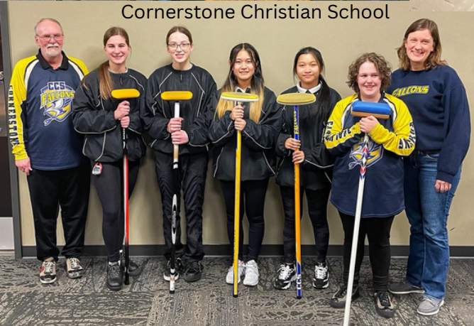
Cornerstone Christian School