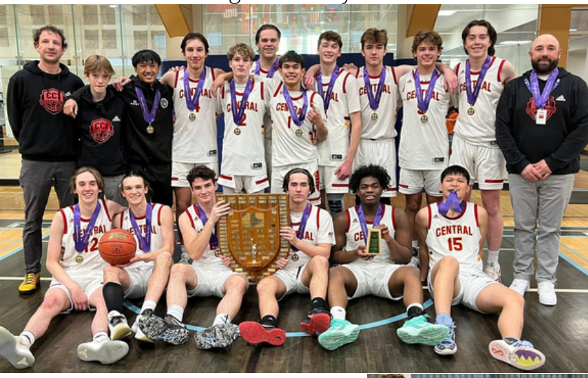
Central Collegiate 4A Boys Gold!