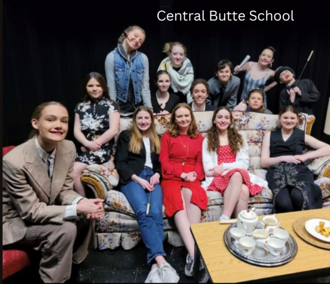
Central Butte School