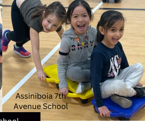
Assiniboia 7th Avenue School