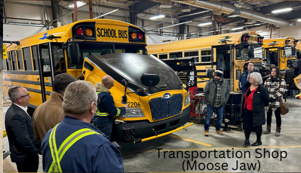
Transportation Shop (Moose Jaw)