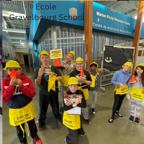
Ecole Gravelbourg School