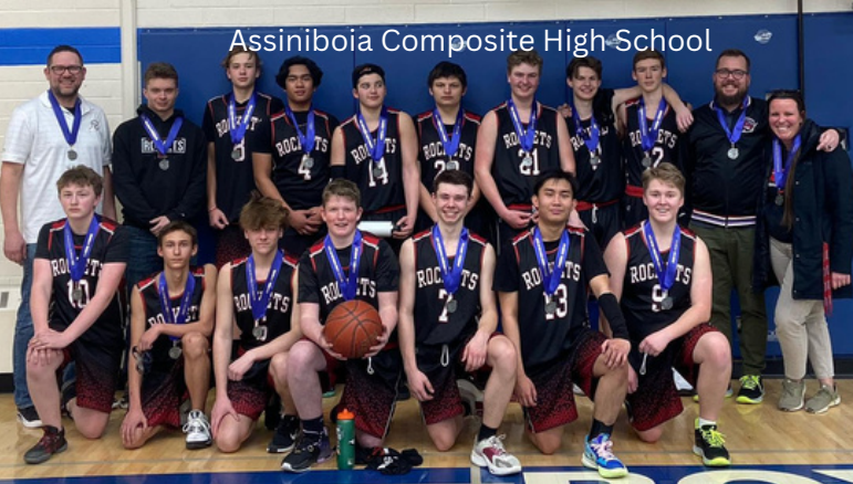
Assiniboia Composite High School