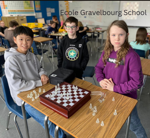
Ecole Gravelbourg School