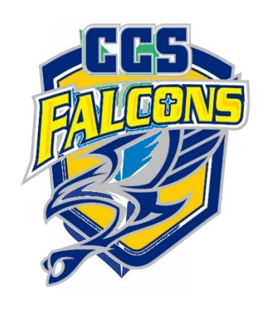
Cornerstone Christian School