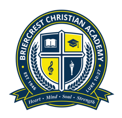
Briercrest Christian Academy