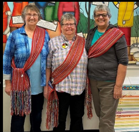
Photo above: Our 3 Kokums have been in many classrooms working with students on beading, medicine bags, drums, and many other activities.