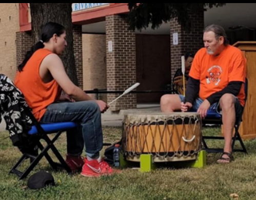
Photo at left: Many of our schools continued to host celebrations of Indigenous culture and ceremony. On September 30, Riverview, Empire, and Westmount came together for National Day of Truth and Reconciliation.