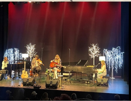
Photo at left: In December, Music City in Moose Jaw was also hosted by RSP and sponsored by Co-op. There were many takeaways for students including living in the moment, resilience comes from hard times, and be happy right where you are!

Coronach School hosted The Power of Possibility workshop by accessing the River Street Promotions (RSP) fund. The goal was for students to walk away with a sense of hope and desire to create a better tomorrow.